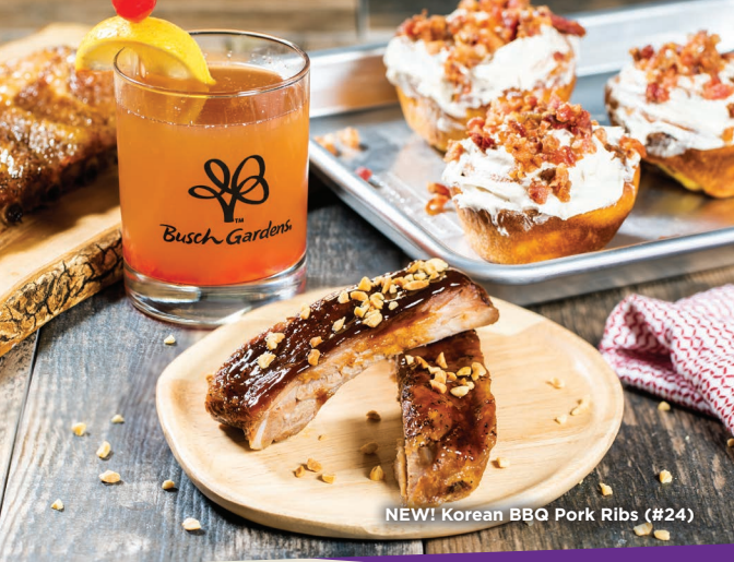
NEW! Korean BBQ Pork Ribs (#24)