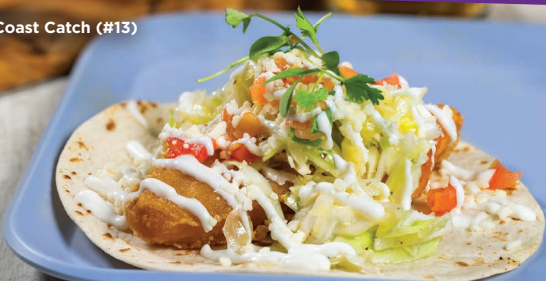
West Coast Catch (#13)