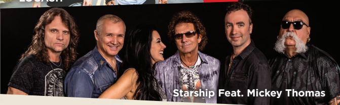
Starship Feat. Mickey Thomas