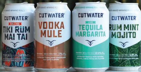
NEW! Cutwater Canned Cocktails (#23)