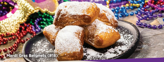
Mardi Gras Beignets (#18)