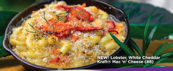
NEW! Lobster, White Cheddar Kraft® Mac 'n' Cheese (#8)