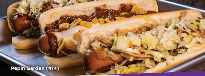
Pepin Garden (#14)