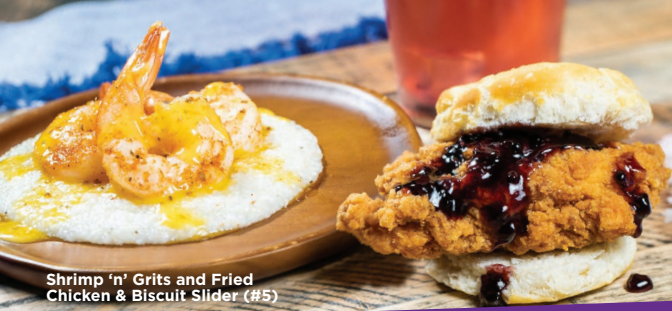
Shrimp 'n' Grits and Fried Chicken & Biscuit Slider (#5)