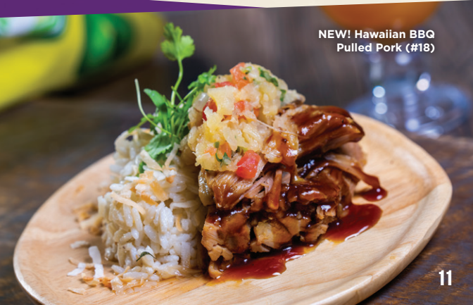
NEW! Hawaiian BBQ Pulled Pork (#18)