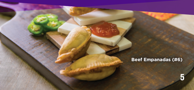
Beef Empanadas (#6)