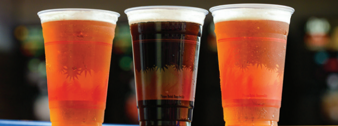
Pepin Garden (#11)