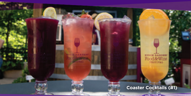
Coaster Cocktails (#1)