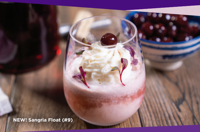
NEW! Sangria Float (#9)

Pair desserts with Notorious Pink Grenache Rosè - France