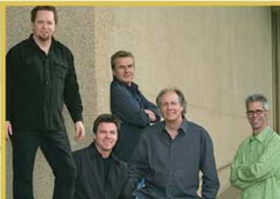
LITTLE RIVER BAND